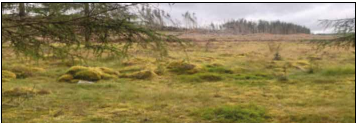
Above: Craighead, Settlement Kilry Perthshire